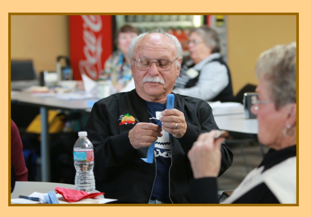
..I know I have the winning ticket....