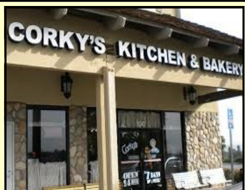
Good Food &amp; reasonable prices....a Socalm favorite.